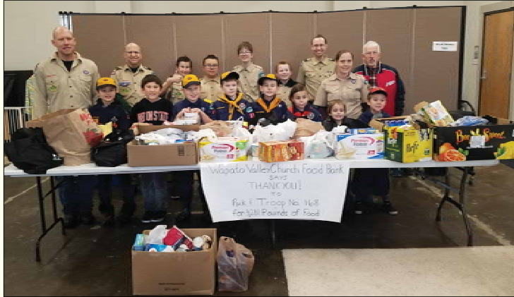
GASTON'S BOY SCOUT TROOP #168 AND CUB SCOUT PACK #168

On December 2 ,Gaston's Boy Scout Troop 168 and Cub Scout Pack 168 collected food for the Gaston Food Bank. The boys walked on the cold rainy day for two hours and collected 638 pounds of food.