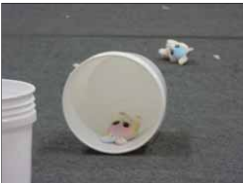
← Photo of bunnies in a bucket and on floor outside of buckets