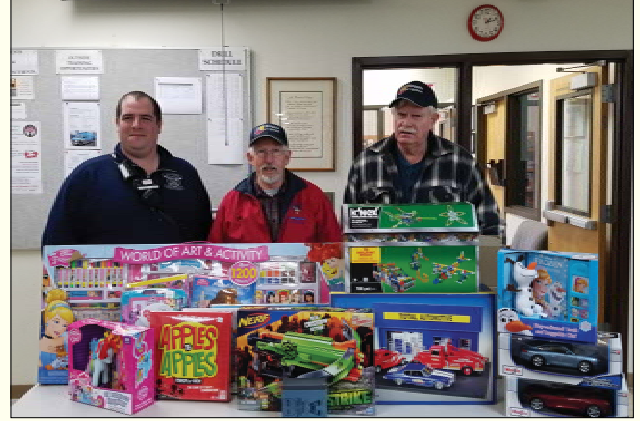
GASTON PYTHIANS COLLECT TOYS FOR CHRISTMAS

The Western Washington County Fire Departments annually collect toys for kids at Christmas.