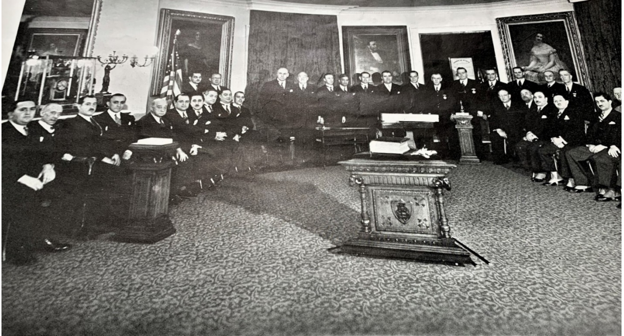
The Castle Hall set-up in the Diplomatic Reception Room in the White House where Franklin Delano Roosevelt, President of the United States, was initiated into the order Knights of Pythias.

Altar and Bible in the Diplomatic Room in the White House at F.D.R.'s initiation