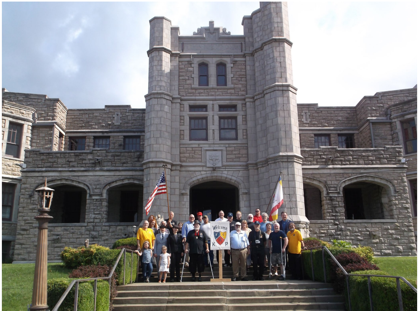
Group photo at the Pythian Castle (former Pythian Home of Missouri), July 17, 2021.