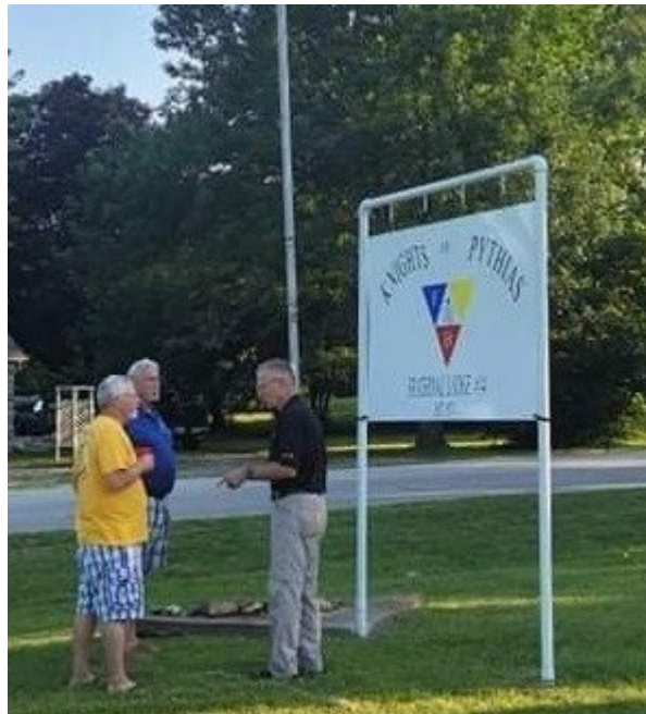
Newly refurbished sign installed at Fraternal #14, lodge instituted on November 18, 1871.