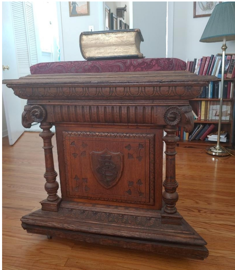
Franklin's Altar and Bible used to initiate F.D.R.