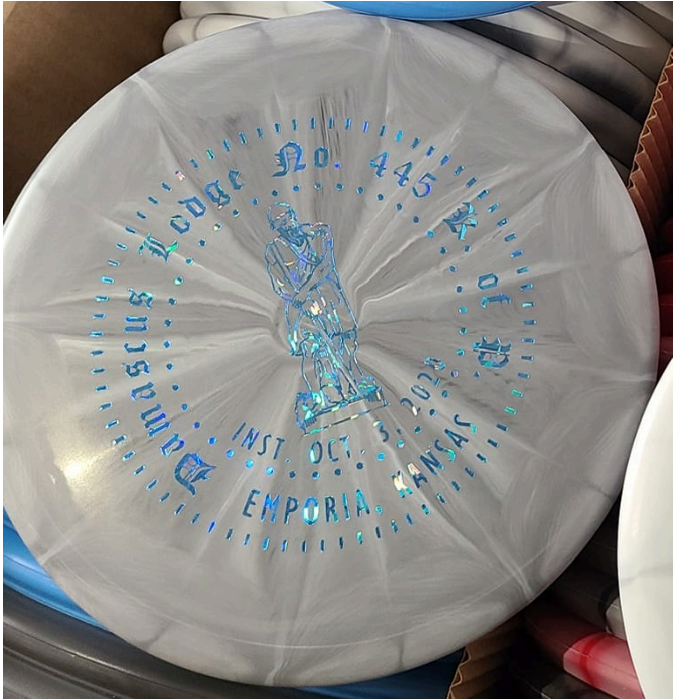
Photo of discs made for Disc Golf event held by Damascus #445, Emporia KS, July 11, 2021.