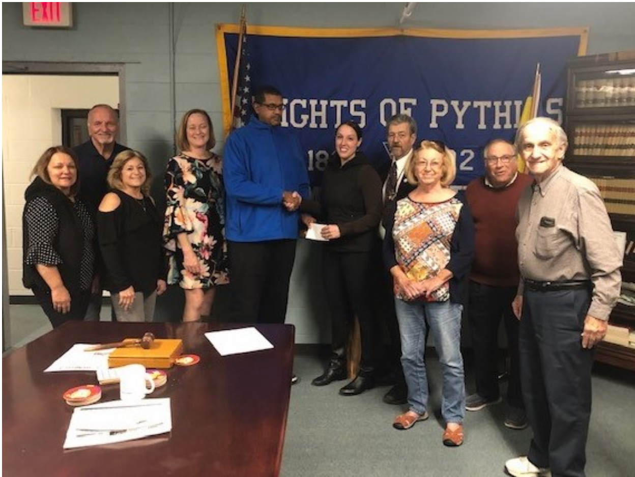
2021 Donation from the Knights of Pythias to Food Pantry Foundation of Stoughton, Inc.

In lieu of the annual auction that Bay State Lodge usually hosts in November (cancelled for the last two years due to COVID) a donation of tickets to a Patriot's game were auctioned off and the net proceeds of $2,000 were donated to Food Pantry Foundation of Stoughton, Inc.