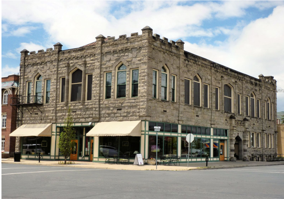
Baker City, Oregon Pythian Castle