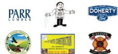
SOME OF OUR LONG TIME SPONSORS