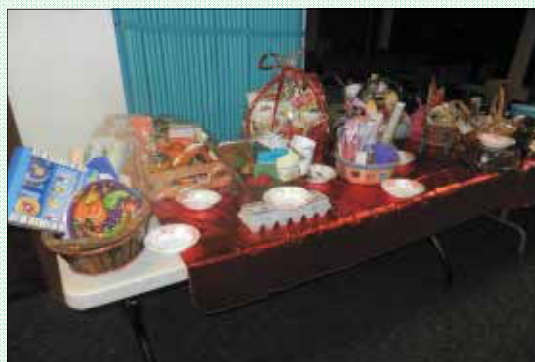
Raffle baskets at Spaghetti Fundraiser Dinner

be done with an education. One of the things the students saw was a 3-D printer that actually printed in aluminum. He made a miniature bearing with the ball bearings already inside of it and a bunch of other amazing things. The builder and company president are going to come and do a presentation for the team about the printer, how he built it, and how his company works.