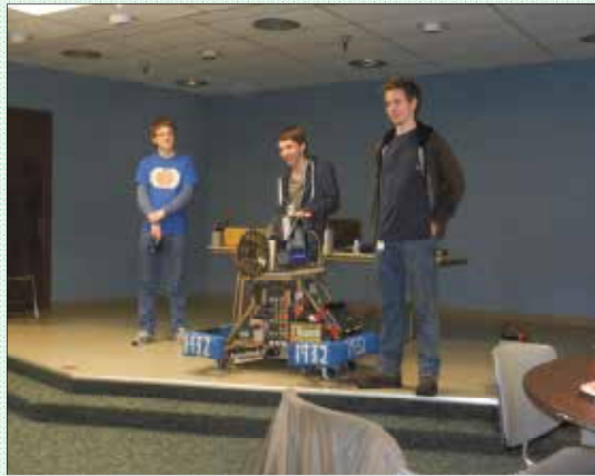
FIRST Students making presentation at November Spaghetti Fundraiser Dinner

October Best, an international trade show at Tektronix was next, where the students presented the robot and the FIRST program. It was a really wonderful experience with lots of good contacts and some thought provoking experiences about just what can