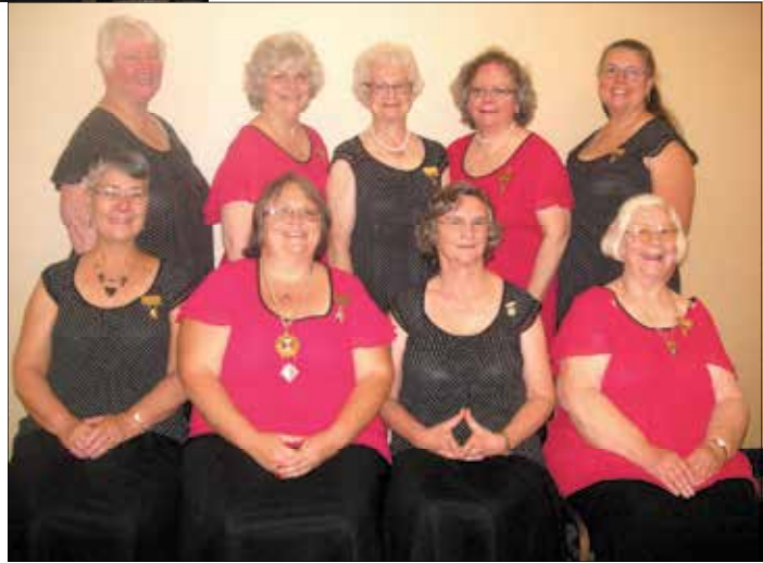
2011 ~ 2013 Grand Lodge Officers