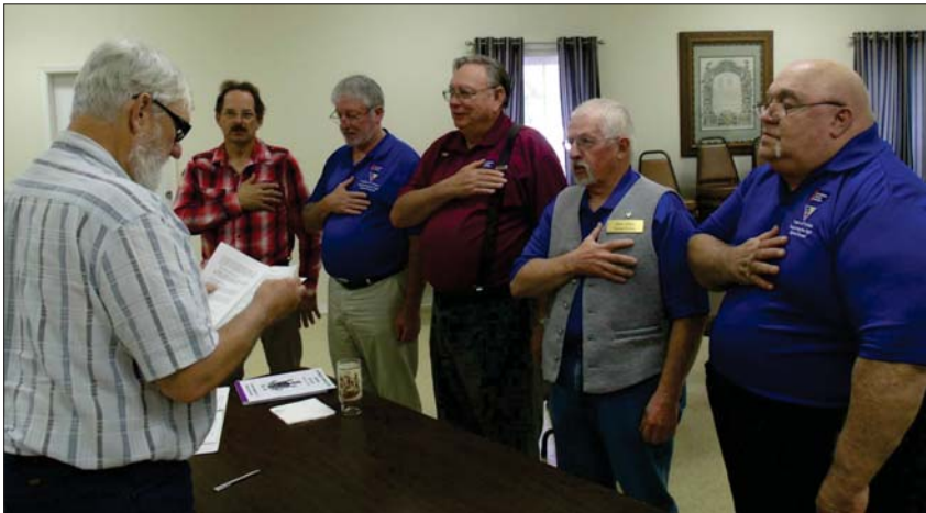
2014 ~ 2015 Grand Lodge Officers taking their oath.

Plans are underway for the October 2015 Grand Convention. At the time of this printing, it is believed that the Knights' Convention will be held at Pendleton's Lodge Hall while the Sisters will be meeting at the Red Lion Hotel also in Pendleton, Oregon. We hope to see everyone there for another Grand time!