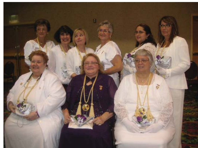
2014-2016 Supreme Temple Officers