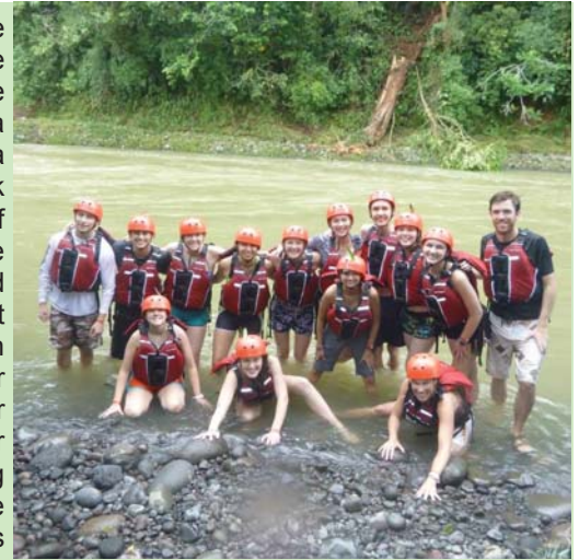
Whitewater rafting in the Saraquipi Rainforest

measurements of the shell or carapace both with a tape measure and a caliper, then do a complete body check and record data. If we got to the turtle before she started laying we could count her eggs by laying in the sand behind her and sticking our gloved hand under her tail inside her egg chamber so that we could catch the eggs and count them as they fell. Finally, we marked the sea turtle's nest in a way that poachers couldn't find it. The research assistants would also get to tag the turtles, but we didn't have enough experience to do that. In Tortugaro we completed research experiments to see what