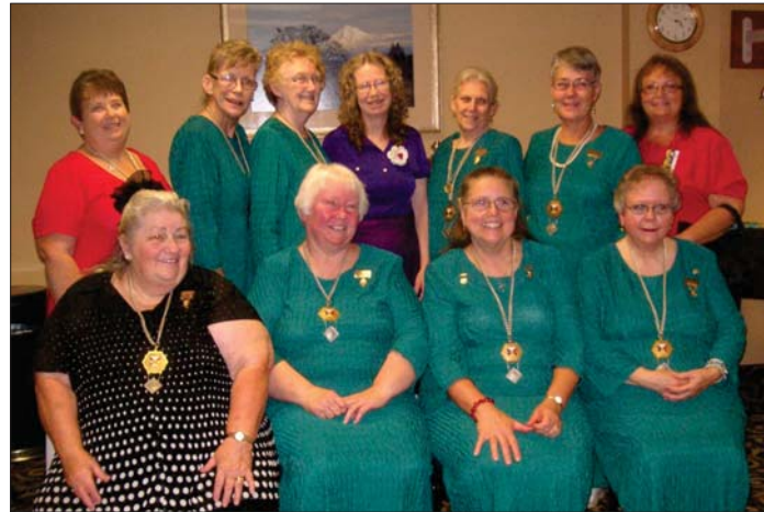
2014 ~ 2015 Grand Temple Officers